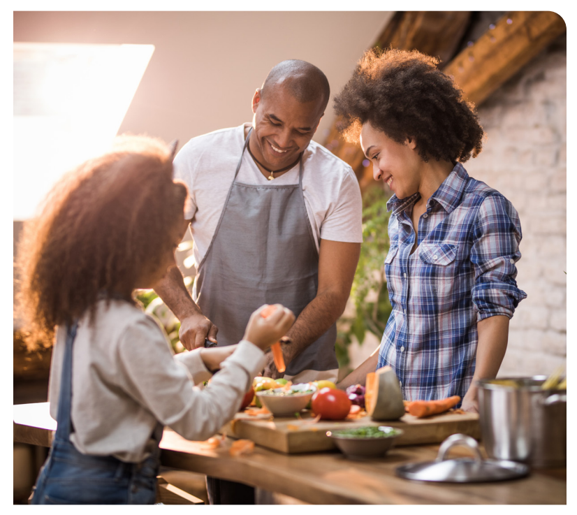
Improving your diet is one of the the many things you can do to avoid a heart attack.